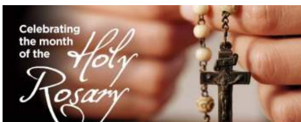
"The Rosary is the most beautiful and the most rich in graces of all prayers." - Pope Saint Pius X